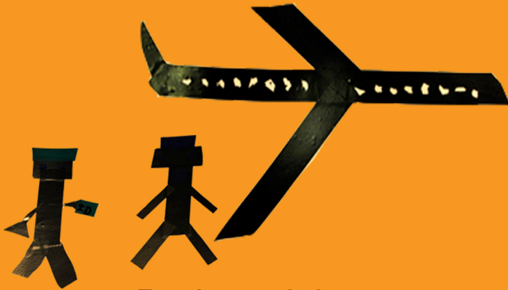
Travel on an airplane