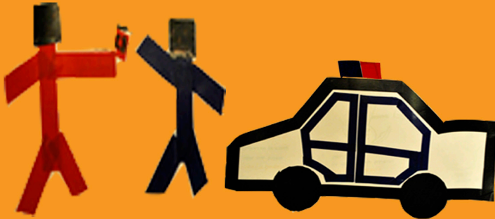
Prove your identity to the authorities