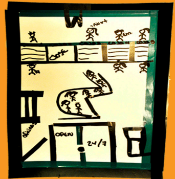
Enter some government buildings