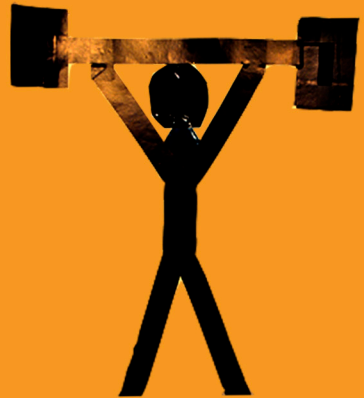
Get a gym membership